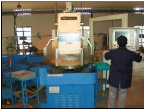
➤ Grinding Machine

In the near future we will be procuring additional equipment for carrying out production of Journal Bearings and other Turned Precision parts.