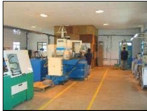
➤ Thrust Bearing Assembly Section