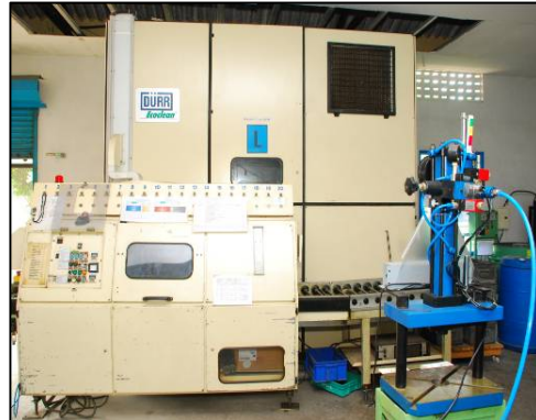
➤ Washing Machine