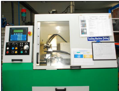
➤ Drilling Machine